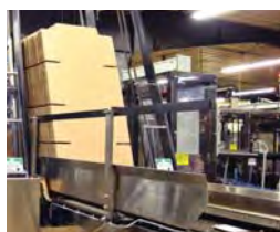
STANDARD 3' OR 6' CASE BANK MAGAZINE