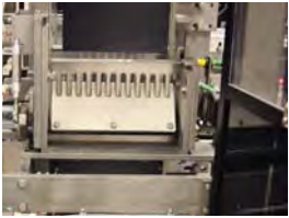
LOW SPEED BUMP UPSTACKER