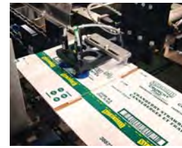
OPPOSING CUP SET-UP