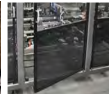
1/4" ACRYLIC GUARD DOORS