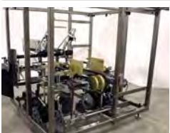
HEAVY DUTY FRAME