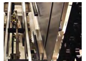
HIGH SPEED ROTARY UPSTACKER WITH SURGE/METERING BELTS