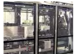
STAINLESS STEEL MESH GUARD DOORS (OPTIONAL)