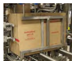
4' CASE BLANK MAGAZINE (BOTTOM LOAD ONLY)

All pictures shown are for illustration purpose only. Actual product may vary.