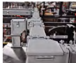
INTERFACE WIRE WAY