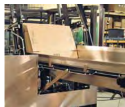
DUAL BLANK STYLE (WA, KD OR TRAY)

Massman Automation offers different case blank magazines to handle all types and sizes of corrugate and chip board blanks, with many unique design features to ensure proper blank