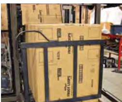
LOW LEVEL MAGAZINE