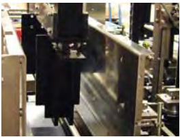
UPSTACKER WITH PRODUCT SUPPORT

Massman Automation has the right infeed solution for your product.