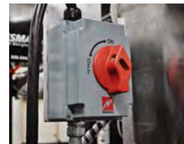
LOCK OUT - TAG OUT