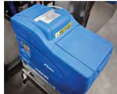
NORDSON HOT MELT GLUE SYSTEM