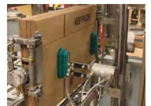
VACUUM TRANSFER (BOTTOM LOAD ONLY)