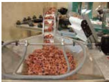
Bulk Parts Hopper