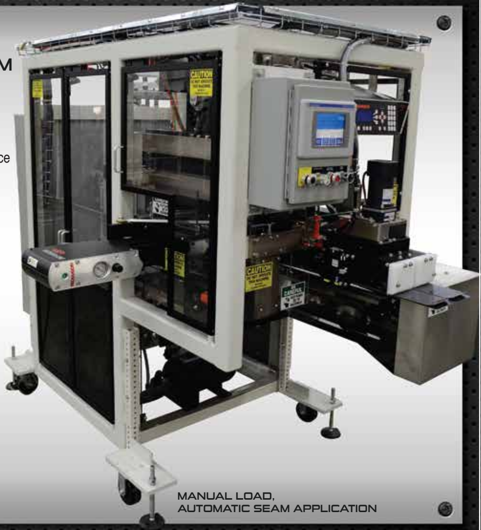
MANUAL LOAD, AUTOMATIC SEAM APPLICATION